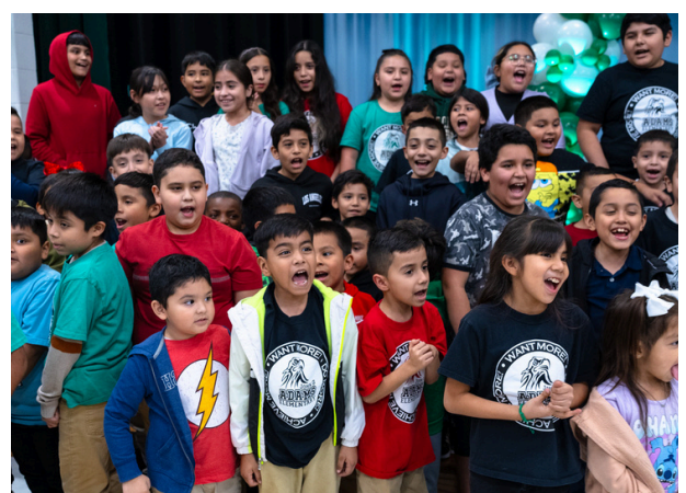
Joyful students celebrate at the mural unveiling event..