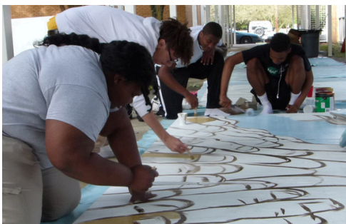
Scotlandville High School students working on mural (see more on page 5).

This school-based mural program brings art, culture, and healing into learning environments by transforming blank walls into vibrant reflections of student identity and community pride. For over 12 years in Baton Rouge, and in recent years across Dallas and Colorado, The Walls Project has partnered with schools to co-create murals that celebrate local heritage, amplify student voices, and highlight shared histories.