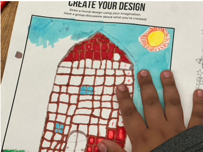
Student shows off their mural-inspired art.