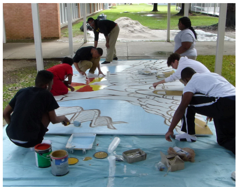
Scotlandville Magnet students helping work on the mural's panels.