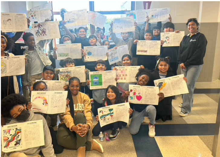
JN Ervin students show their completed mural masterpieces.