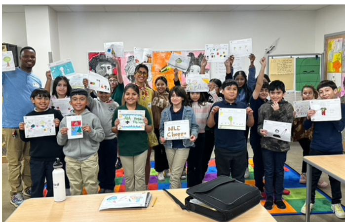
Students show off their completed mural vision boards.