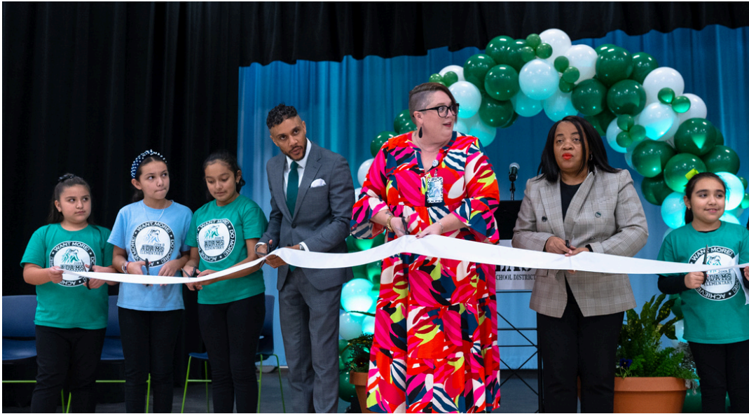
Mural unveiling ribbon cutting at John Q. Adams Elementary in Dallas, TX.

This school-based mural program brings art, culture, and healing into learning environments by transforming blank walls into vibrant reflections of student identity and community pride. For over 12 years in Baton Rouge, and in recent years across Dallas and Colorado, The Walls Project has partnered with schools to co-create murals that celebrate local heritage, amplify student voices, and highlight shared histories.